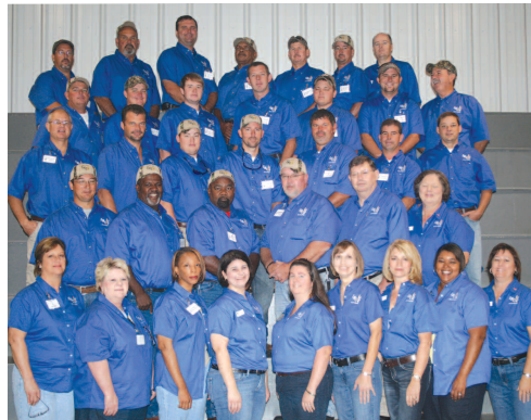
Ocmulgee employees report for duty at 2011 Annual Meeting.