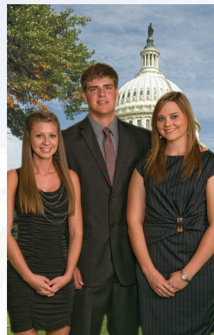
The U.S. Capitol was one of many stops on the Washington Youth Tour.